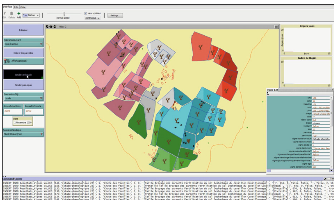
Figure 3. Screen capture of DAHU-Vigne model.

model to determine the potential harvest date (the start of the harvest depends on the decision of the winemaker).